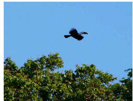
A Toucan in Anavilhanas

For boat charting and closed groups, contact us at expeditions@katerre.com . This price does not include airfare.