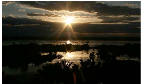
Sunrise in Madadá