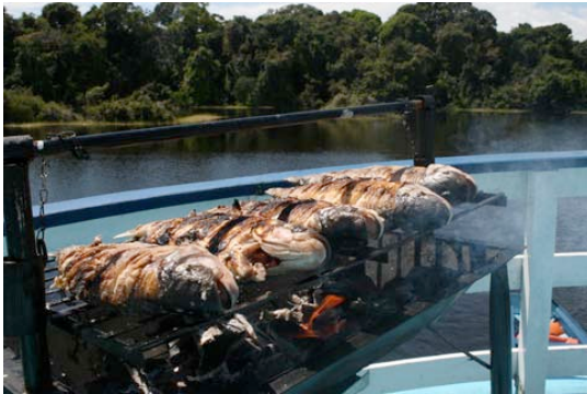
Aracu on the Grill