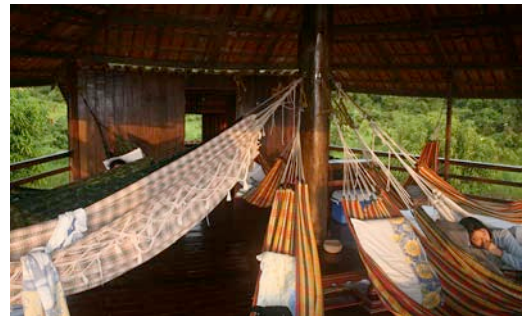
Madadá Jungle Bungalow