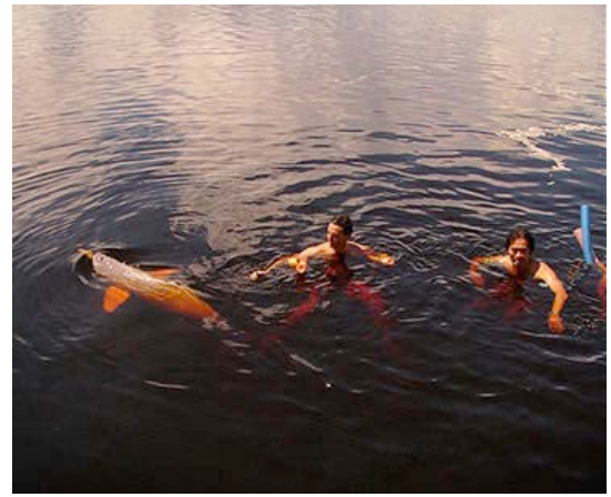
Swimming with river dolphins in Novo Airão